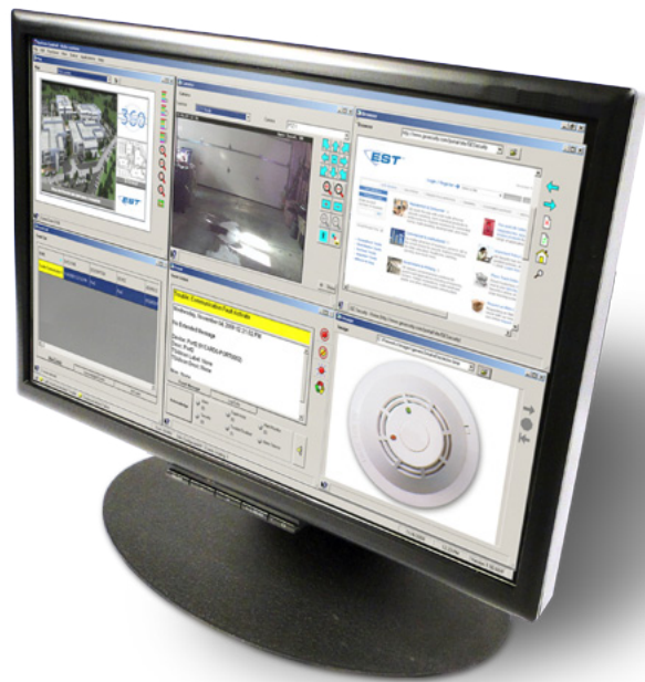
Your compass: EST3's FireWorks Graphical Command Interface.

Anything less is just groping in the dark.